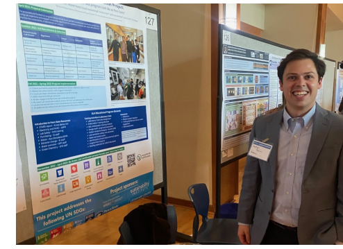
MGLC of a MRSEC lab presents a poster on the program at the graduate research exhibition.