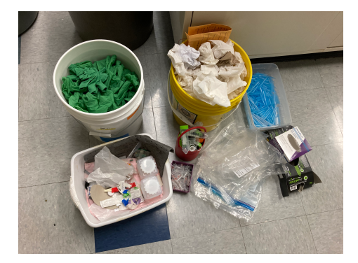
Waste audits by SLAs revealed insights about each lab's purchasing and disposal habits.

The development of skills and knowledge about sustainable lab practices is critical for future scientific leadership in the workforce. Partnership with the Penn State Sustainability Institute has been key to ensuring institutional impact.