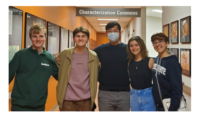
The first cohort of 5 SLAs supported their assigned lab's My Green Lab certification effort.