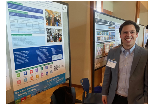
MGLC of a MRSEC lab presents a poster on the program at the graduate research exhibition.