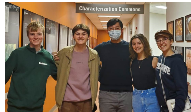
The first cohort of 5 SLAs supported their assigned lab's My Green Lab certification effort.