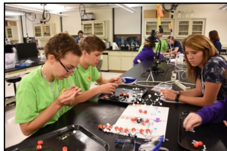
Balancing tactile equations

A five-day STEM Extension program in July 2017 provided ten blind or low-vision college-bound students with a full-access experience in college chemistry and physics labs as part of Summer Academy , a three week college transition program hosted by the PA Bureau of Blindness and Visual Services, Office of Vocational Rehabilitation, and Bureau of Special Education.